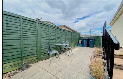
Pitch Fee: approx £208.24 per cal month Subject to Annual Review Council Tax Band: 'A' Tenure: 1983 Mobile Homes Act Agreement